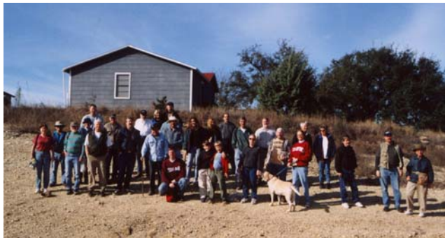
February 2004 Field trip to Killeen